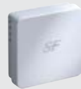
SFTHAPSENRF RF Wireless Remote