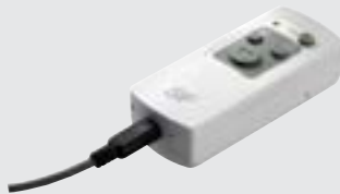
SFTHAPUSB USB Programmer