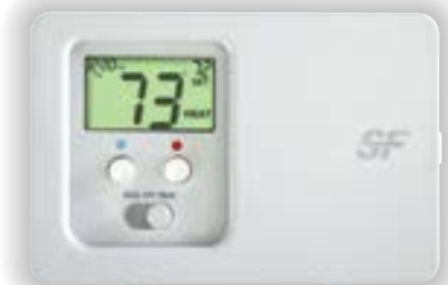
5.5" w x 3.6" h x 1.1" d