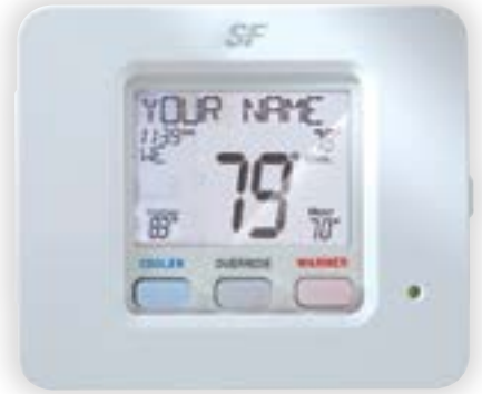
5.2" w x 4.4" h x 1.1" d