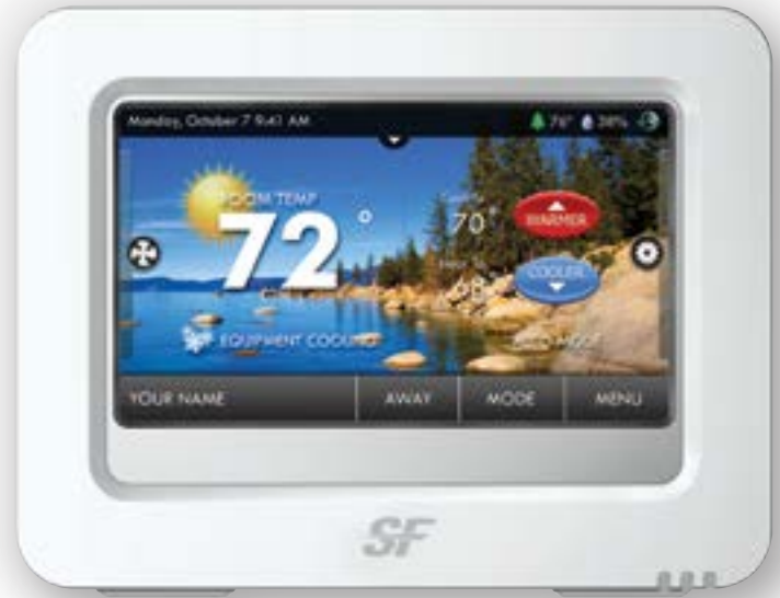
5.2" w x 4.0" h x 1" d