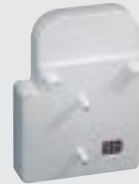
SFTHAPSENREC RF Module