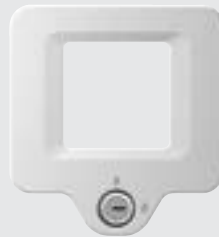
SFTHAPLOCK Lock Ring