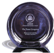
1998 EPA Climate Protection Award