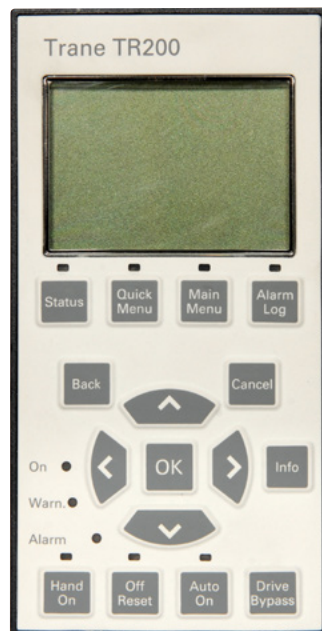
TR200 keypad with one-touch access to bypass operation

The electronically controlled bypass option allows single-button keypad access to drive and bypass operations. This option also allows for all drive communication and control capabilities to be available during bypass operation to maintain indoor environmental quality.