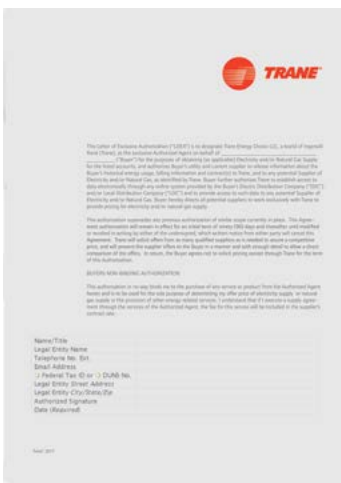
Letter of Authorization