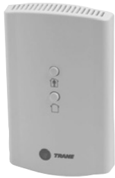
BAYSENS073 BAYSENS074 BAYSENS075