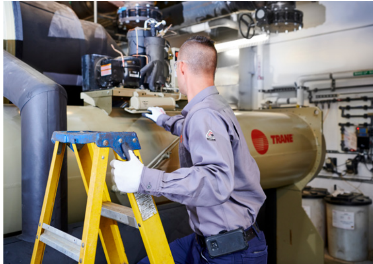
Periodic inspections and prescribed maintenance in the first year help assure long-term performance

Inspections uncover the subtle and obvious chronic operational problems that could impair efficiency and shorten the life of your system. Inspections vary depending on the type of equipment and controls. Typically, we confirm critical parameters, examine mechanical components and adjust control settings.