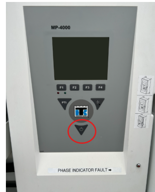
5 Figure 2. Power button