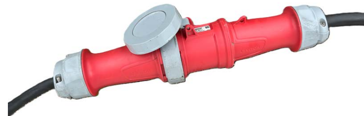
Figure 1. Freezer plug

Note: Push the pin end of the plug all the way into the socket end. Then twist the locking ring, to ensure proper installation.