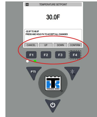
Figure 4. Setpoint menu