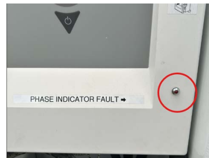
Figure 3. Phase light