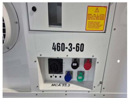
Figure 3. Cam connectors