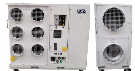
Figure 2. Duct connectors