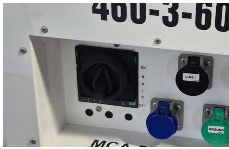
Figure 4. Closeup of breaker