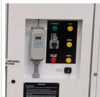
Figure 5. Indicators

Note: If no phase fault is present, skip step 8 and proceed to T-Stat Setup.