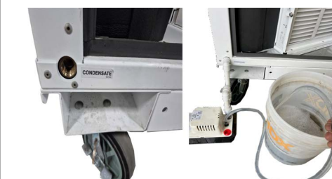
Figure 1. Condensate pump