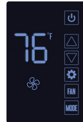
Figure 5. Touchscreen

Trane - by Trane Technologies (NYSE: TT), a global climate innovator - creates comfortable, energy efficient indoor environments for commercial and residential applications. For more information, please visit trane.com or tranetechnologies.com .