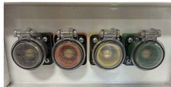
Figure 3. Cam connectors