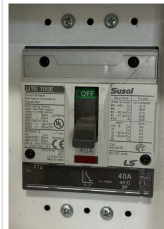
Figure 4. Unit circuit breaker

Note: Allow the automatic compressor crankcase heaters to run for at least 4 hours before attempting to operate the unit in cooling mode.