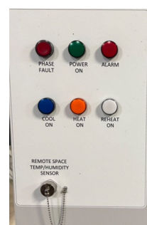
Figure 6. Indicators