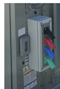
Figure 4. Cam connectors