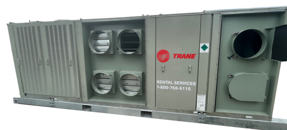
Figure 2. Duct connectors

Note: Trane Rental flexible duct must be secured to prevent duct collapsing when used as return duct.