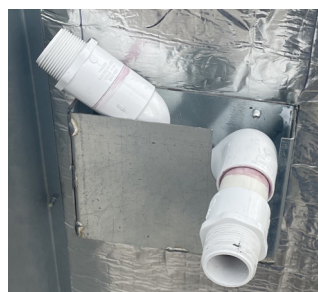
Figure 1. P-trap