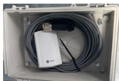
Figure 3. Remote sensor

Note: Remote sensor is required for proper control when introducing outdoor air through the return connections.