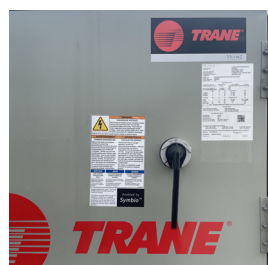
Figure 5. Unit disconnect

Note: Allow the automatic compressor crankcase heaters to run for at least 4 hours before attempting to operate the unit in cooling mode.