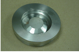
Figure 1. Disk orientation

When installing a replacement, non-fragmenting, metal rupture disk, the dome of the disk must be facing the chiller. See Figure 1, p. 2 for details.