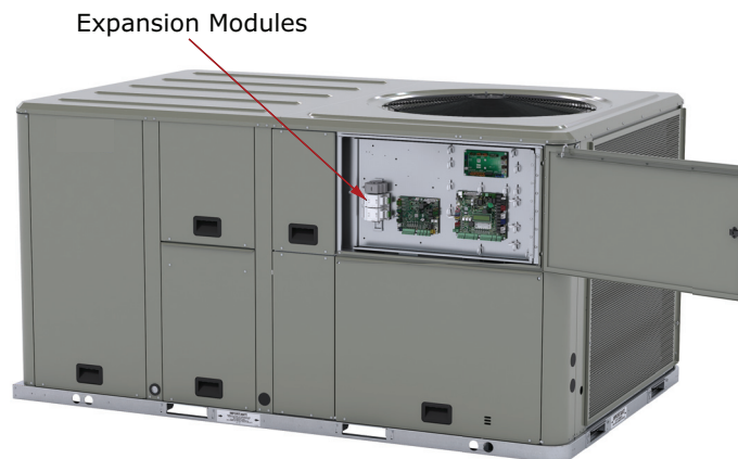
Figure 2. Precedent - expansion module mounting location

Important: If model number on Precedent unit digit 21=0, no communication options are enabled. The expansion module kit is not licensed or supported for this option. To enable an expansion module kit, the Symbio™ 700 must be replaced through service parts with a properly licensed Symbio 700.